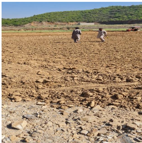
Figure-5.33: WC-KP team visiting location of Usman Khan Check Dam (Swabi) on 17 March 2022