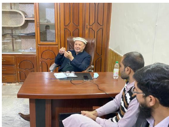
Figure-5.2: WC-KP Team meeting on 10 February 2022.