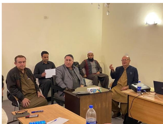
Figure-5.18: DG S&WC Concluding Remarks on 25 February 2022.