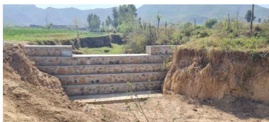
Figure-5.31: WC-KP team Monitoring Irfan Khan Check Dam (Swabi) on 17 March 2022