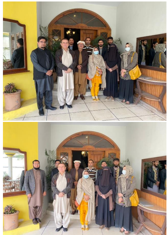
Figure-5.12: Group Photos at end of Training Day-1 on 23 February 2022