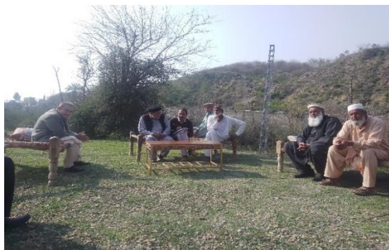
Figure-5.8: WC-KP Team and farmers discussion about the interventions (Nowshera) on 18 February 2022