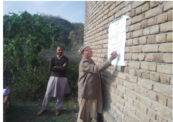
Figure-5.7: WC-KP Team Leader Interviewing farmers about the strengths and weaknesses of the intervention (Nowshera) on 18 February 2022