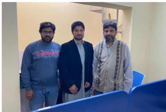
Figure-5.5: WC-KP Team in National Office Islamabad on 15 February 2022.