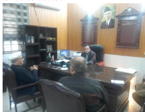
Figure-5.3: WC-KP Team with the Director AED in AED Directorate on 10 February 2022.

An introductory meeting was held in Directorate of Agriculture Engineering Department, Tarnab Form Peshawar on 10 February 2022. Project progress was reviewed and future plan was discussed in details. Moreover, issues and bottle necks also came under discussion.