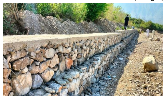
Figure-5.27: WC-KP Team Monitoring Saleem Khan SBS (Mardan) on 16 March 2022