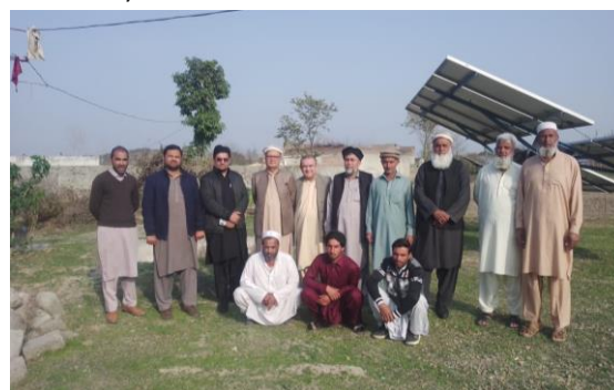
Figure-5.6: WC-KP Team, AED Field Engineer and Local Farmers during case-study field visit to AED's interventions in Walai (Nowshera) on 18 February 2022