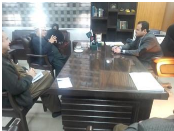
Figure-5.4: WC-KP Team in meeting at AED Directorate on 10 February 2022.

Different aspects of the project like monthly progress Performa (developed by the department), trade ups of the formers, lift irrigation, energy savings due to solarization of the tube wells, departments' setup in newly merged areas of KP etc. were discussed during meeting. WC-KP team asked the department to select a suitable site for a combine visit and case study.