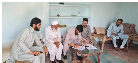
Figure-5.23: WC-KP Team interviewing the beneficiary of Gul Sharaf Khan Check Dam (Nowshera) on 15 March 2022