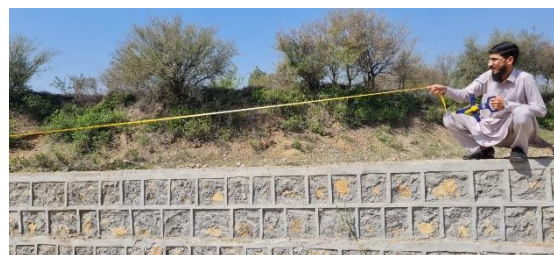
Figure-5.20: WC-KP Team, Monitoring Khan Afzal SBS (Nowshera) on 15 March 2022