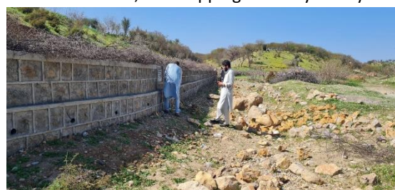
Figure-5.24: WC-KP Team Monitoring Said Zaman SBS (Nowshera) on 15 March 2022