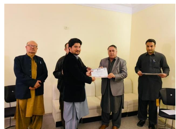
Figure-5.17: Training Day-3 (Certificate Distribution) on 25 February 2022.