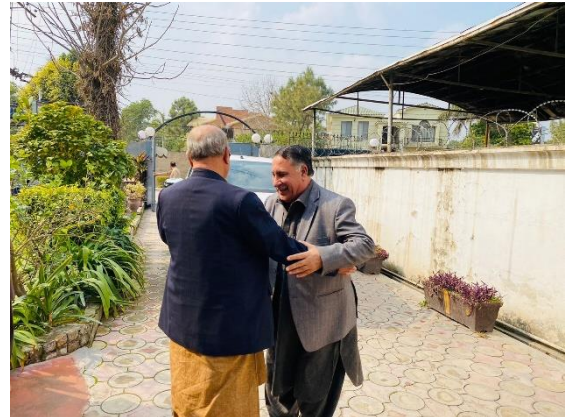
Figure-5.16: Training Day-3 (TL WC-KP receiving DG S&WC) for certificates distribution and concluding remarks on 25 February 2022.

this session and all the trainees satisfied with the training.