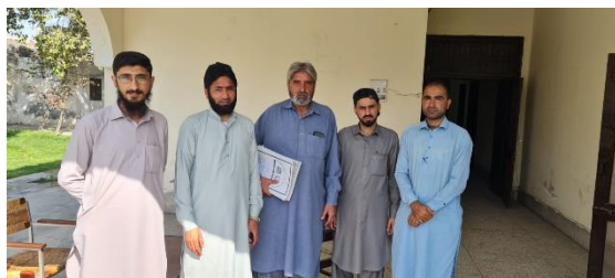
Figure-5.19: WC-KP Team, DD S&WC (Nowshera) on 15 March 2022

The WC-KP team visited DD S&WC office in Nowshera to discuss the visit schedule.